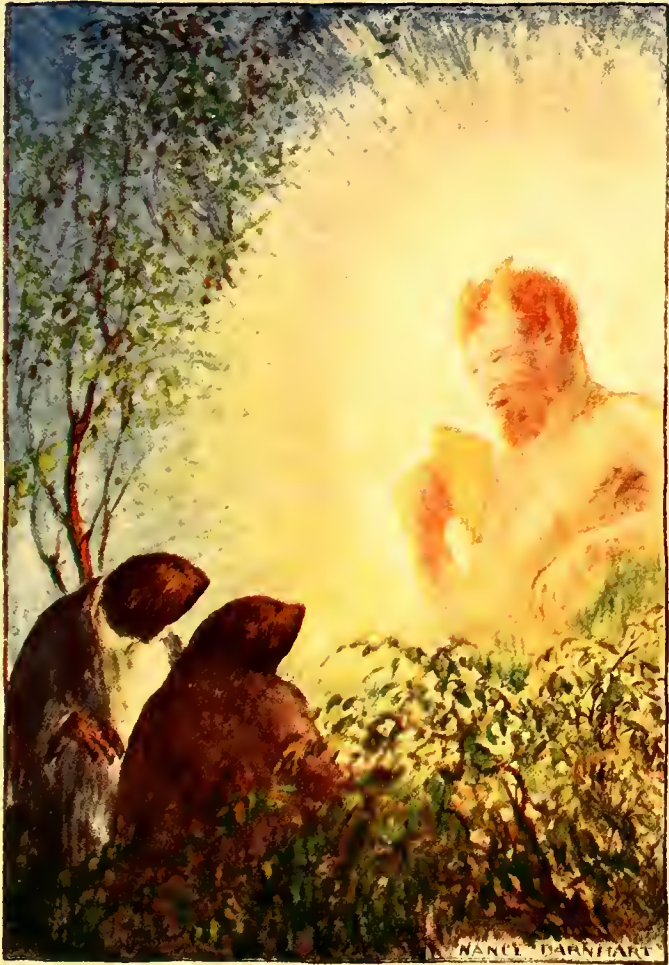
LOOKED IN THE VERY EYES OF THE FRIEND AND HELPER